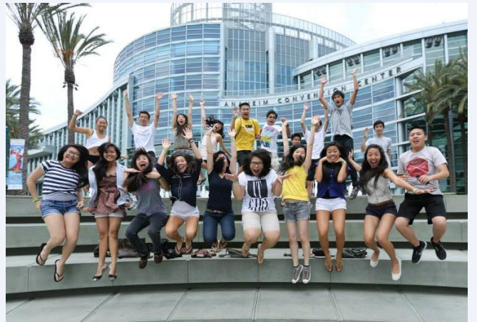
Gabrielino High School