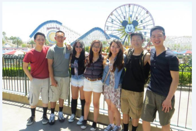
Westmoor High School