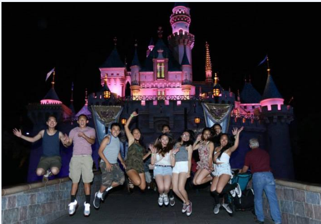
Gabrielino High School