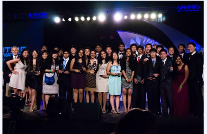
Monta Vista High School