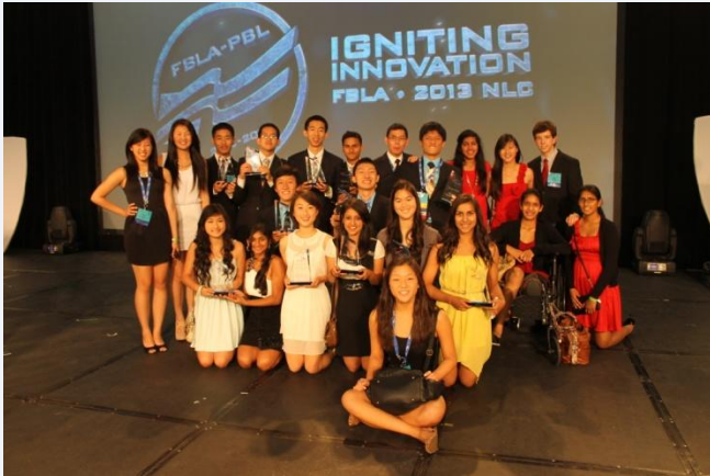
Lynbrook High School