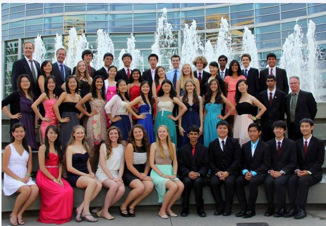
Homestead High School