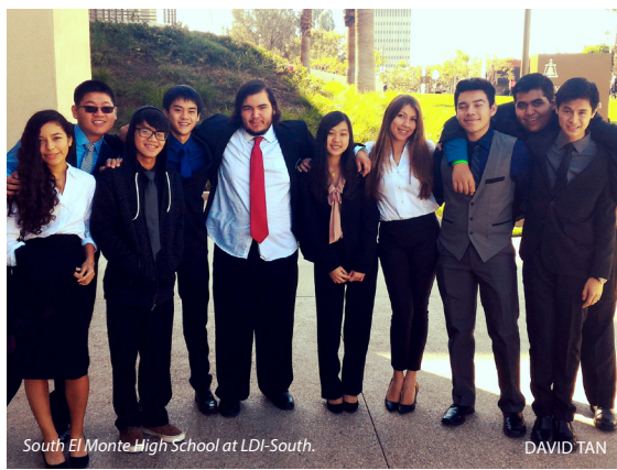
South El Monte High School at LDI-South.