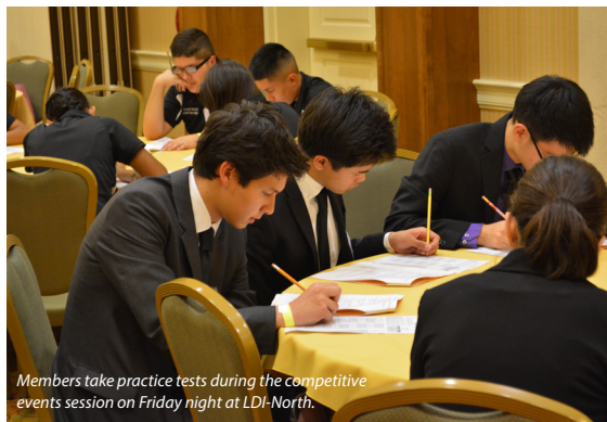
Members take practice tests during the competitive events session on Friday night at LDI-North.