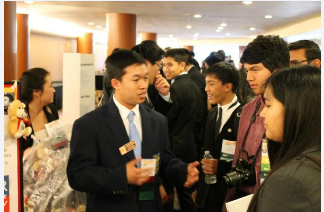
State Office Campaign, SLC 2013

You can begin running for office by completing and submitting an application that could be found at www.caifbla.org . An interview will be followed upon the approval of your application. At the Section or State Leadership Conference, you will have the opportunity to give a speech and campaign. Good luck!