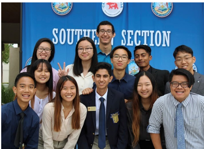
Chapter Highlight: Yorba Linda High School

Please fill out the form at tinyurl.com/cafblamemberspotlight to be highlighted, and feel free to contact the State Executive Board if you have any questions.