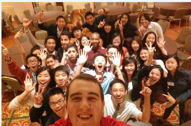
Dublin High School