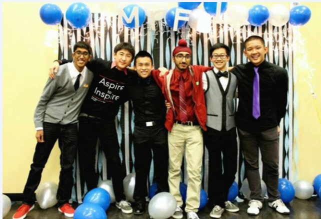
Dublin FBLA Social: Mr. FBLA Pageant Show

There will always be chapters in need of some assistance - even taking a simple action, such as notifying new chapters about grant applications or upcoming conferences - goes a long way in establishing positive connections within your area!