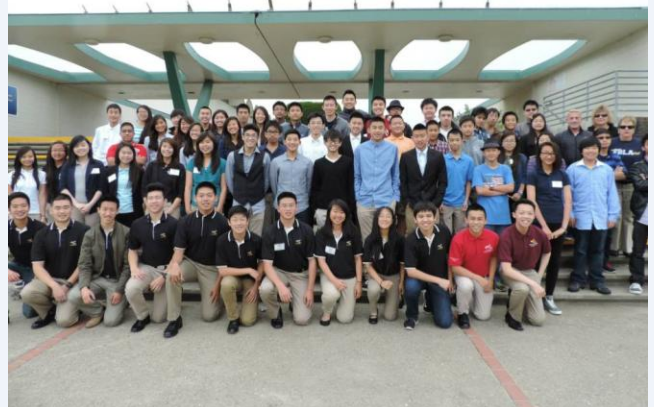
Westmoor High School