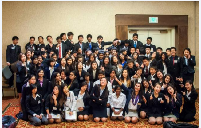
Lynbrook High School