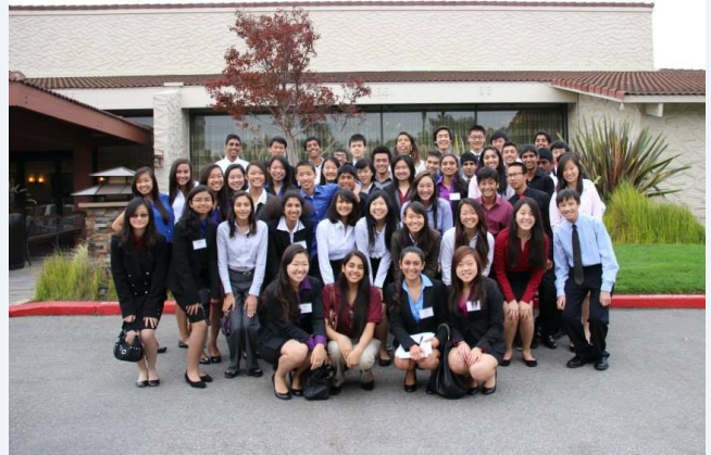
Monta Vista High School