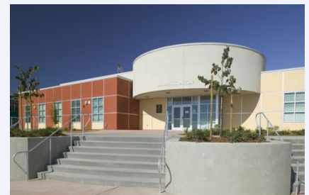
Southern Section: Whitney High School