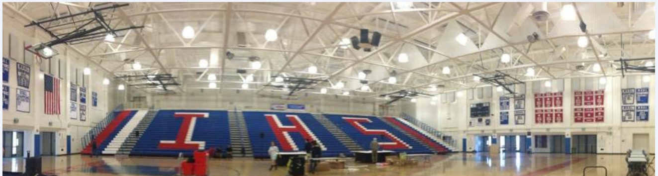
Bay Section: Independence High School