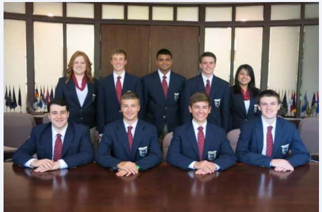
FBLA National Officer Team

Finally, please remember to have fun. Despite some rules that we all need to abide by, it is important for us to remember to have a great time at our conferences, learn all that we can, and meet new people.