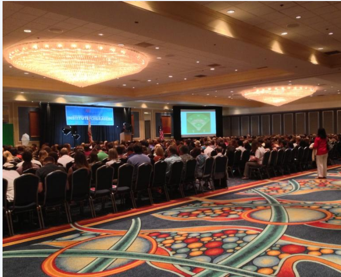
Institute for Leaders 2013