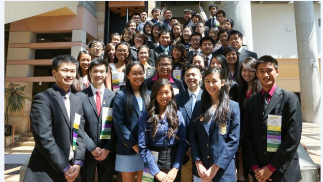
Gabriellino FBLA participates in all 12 state projects every year