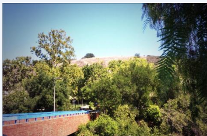
Gold Coast Section: Westlake High School