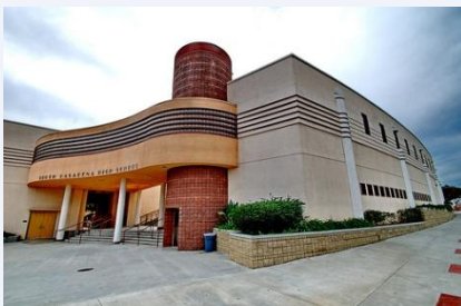
Mission Valley Section: South Pasadena HS