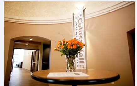
Northern Section: Colusa Wellness Center