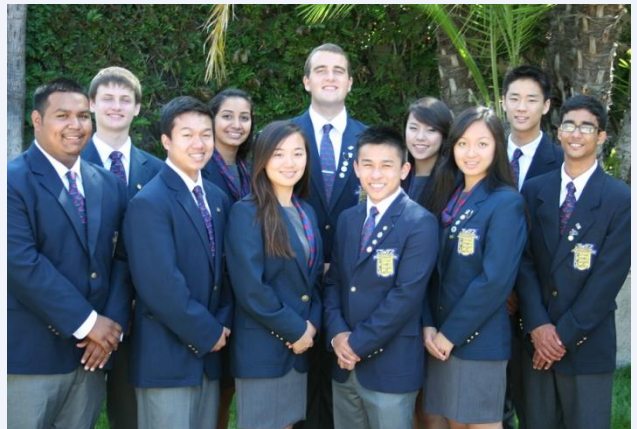
California FBLA State Officer Team