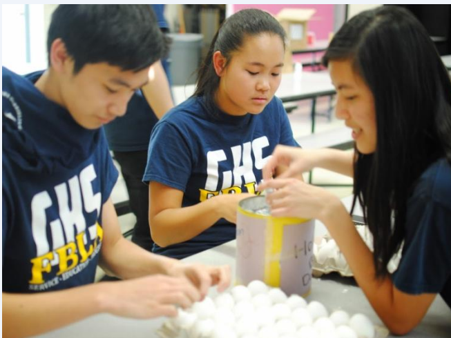
Gabriellino FBLA members interning at the community center

The Gold Seal Award distinguishes the top chapters in California. Ribbons are awarded to qualifying chapters at both the State and National Level. Help show that your chapter is the best and participate in this year's Goal Seal Award!