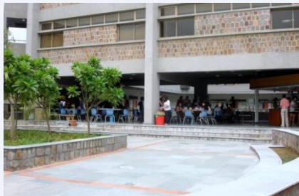
Central Section: Delhi High School