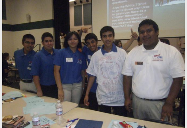
Central Section OAT Day 2012

OAT Day is a great way for teambuilding within the chapter and the section. Get ready to improve your leadership and plan out the FBLA year with your chapter and officers!