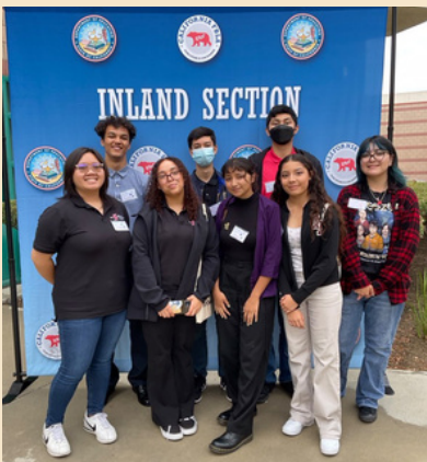
Officers from Palm Spring High School snap a pic in front of the Inland Section backdrop!

As we headed to the theater for the closing session, many officers were full of laughter, joy, and enthusiasm. The Inland Section team could not have been more proud of how the day had gone by. We would like to thank those who were able to attend OAT Day, especially our host Eleanor Roosevelt High School. Once again, we prove that the Inland Section is the best section in California!