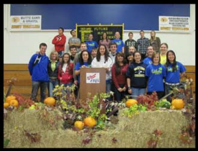
Sutter Union FBLA running a charity auction.