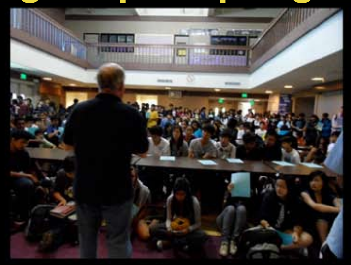
Monta Vista holding a meeting.

Monta Vista FBLA had a simple and common goal this year, and they went to extraordinary measures to obtain it. They have set an example that all other CAFBLA chapters should strive to surpass.