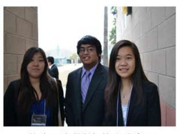
Members at the 2012 Inland Section Conference