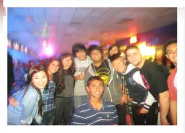
FBLA Members at a Cosmic Bowling Social