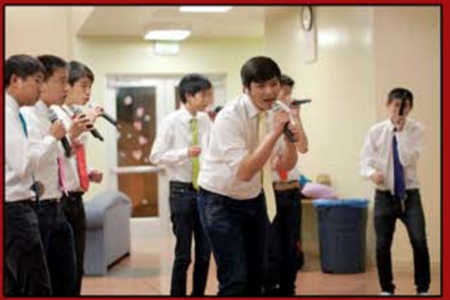
Los Altos' concert was a big success.

The concert was a reasonable success, with many of our audience members from other schools. It was just what we wanted it to be: a casual open mic. In the end we made over $100 in profit. It has secured a solid foothold for us to think even more creatively, dream bigger, and aim for higher goals next year.