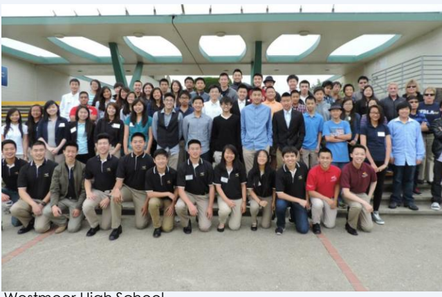
Westmoor High School